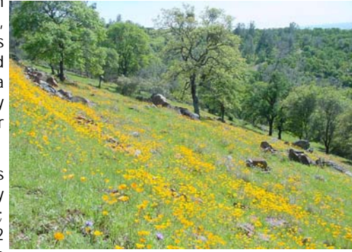
Wildflower slope in Nevada County grazed by livestock

In 2009, we focused on working landscapes consisting of farms, ranches and actively managed forestlands; mostly privately owned; covering more than 1.4 billion of the nation's 2.2 billion acres. California alone has over 20 million privately grazed acres.