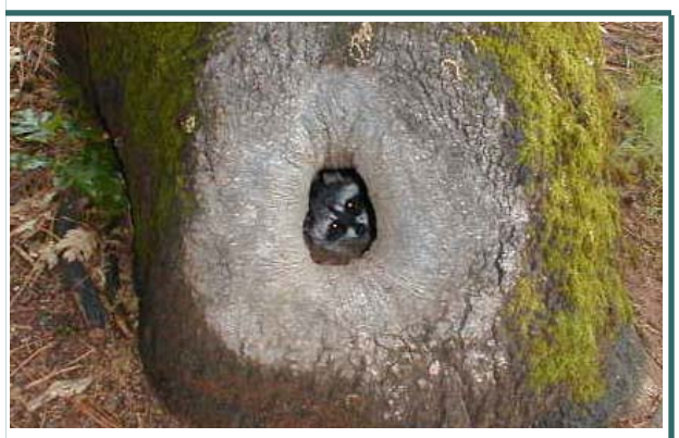
Raccoon visitor

Providing leadership in implementing the Bear River Management Plan, the coordinator helped implement programs to maintain and improve water quality to provide habitat for aquatic life, and aesthetic and recreational enjoyment for the public. Working with the long-term goal to reduce the risk of catastrophic fires within the watershed, the