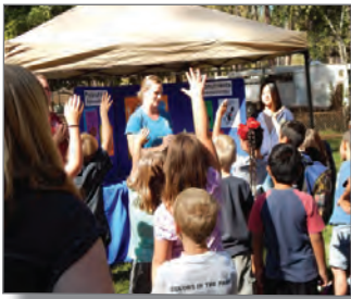
CALFRESH – NUTRITION FOREST HILL LUMBER – MILLING