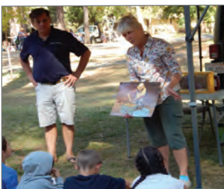
NC BEEKEEPERS – WHY WE NEED POLLINATORS NC AG COMMISSIONER – INSECTS AND WEIGHTS