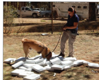
CALIFORNIA DEPT OF AGRICULTURE – PEST-DETECTING DOGS SFREC – ANIMALS