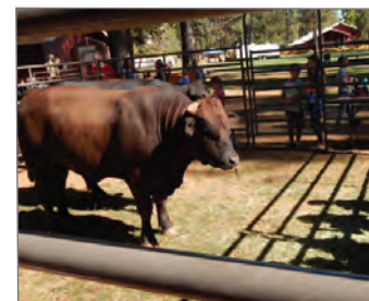
FFA – BEEF AND SWINE