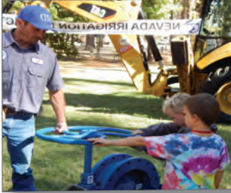
NID – WHERE YOUR WATER COMES FROM