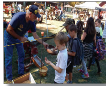
NEVADA COUNTY FLYWHEELERS – GRINDING FOOTHILL FIBERS GUILD – SPINNING