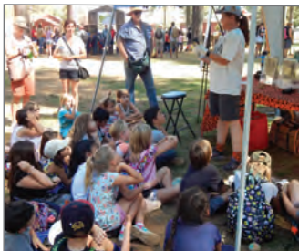
NORCAL BATS – THE IMPORTANCE OF BATS TO FARMS/RANCHES; SFAS – BIRDS AS PEST SUPPRESSION