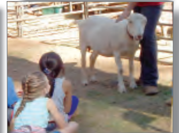
FFA – TOP 10 AGRICULTURAL COMMODITIES 4-H – POULTRY, GOATS, AND SHEEP