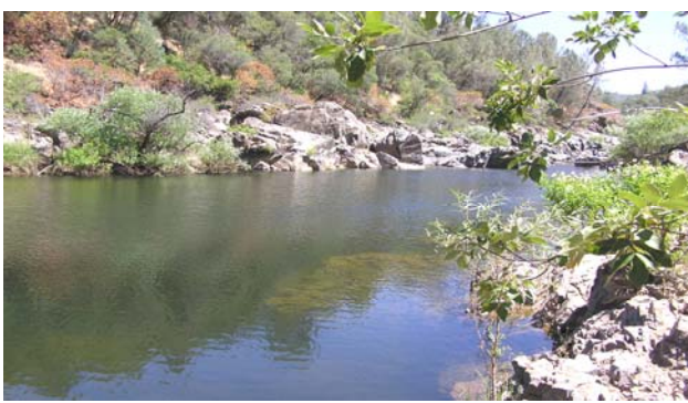
The Bear River west of Highway 49 (Nevada-Placer County Line)

The Bear River Watershed Group meets monthly and is made up of agencies, local businesses, environmental groups, and concerned citizens. The meetings are open to the public and everyone is encouraged to attend. The watershed group is always looking for volunteers to assist with water quality monitoring and watershed assessment, website design and maintenance, and watershed related events.