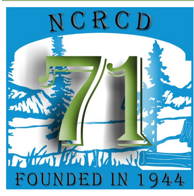
2015 was quite a year for the Nevada County Resource Conservation District!