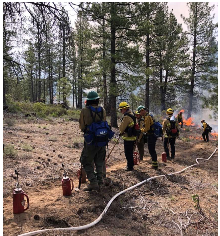
These firefighters have prepared fireline by removing materials down to bare mineral soil. The soil acts as a containment line. Hose lay, charged with water, acts as a supplement to reinforce the line.

Check with the local fire department or the Oregon Department of Forestry when conducting prescribed burn operations.