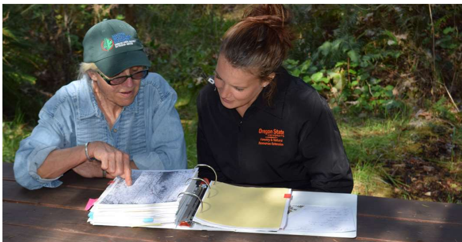
Spend time to fully plan and understand the fuel and topographic conditions on the prescribed burn unit.

Landowners and managers tailor the burn plan to their broader goals. For example, they may focus on improving rangeland fire resilience, reducing the risk to homes from high-intensity fires or increasing the health of a forest stand. These broad goals can be narrowed to specific, measurable objectives for a single burn. Objectives may relate to fire behavior — the rate of spread or flame length, for example. Other objectives relate to a fire's effects — how many trees or shrubs are killed, or how much fuel is consumed. Typically, there is a desired range for these objectives rather than an exact number. Specific, measurable objectives allow you to evaluate the burn later. Collecting observations during the burn can allow for adjustments as ignition operations occur. Monitoring the effects after the burn creates more effective future burn plans and ensures post-fire restoration opportunities are addressed. These may include reseeding or other operations after the burn.