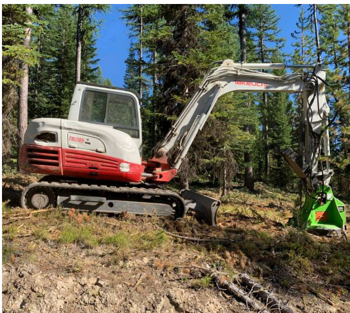
Fuel treatments help moderate fire behavior.